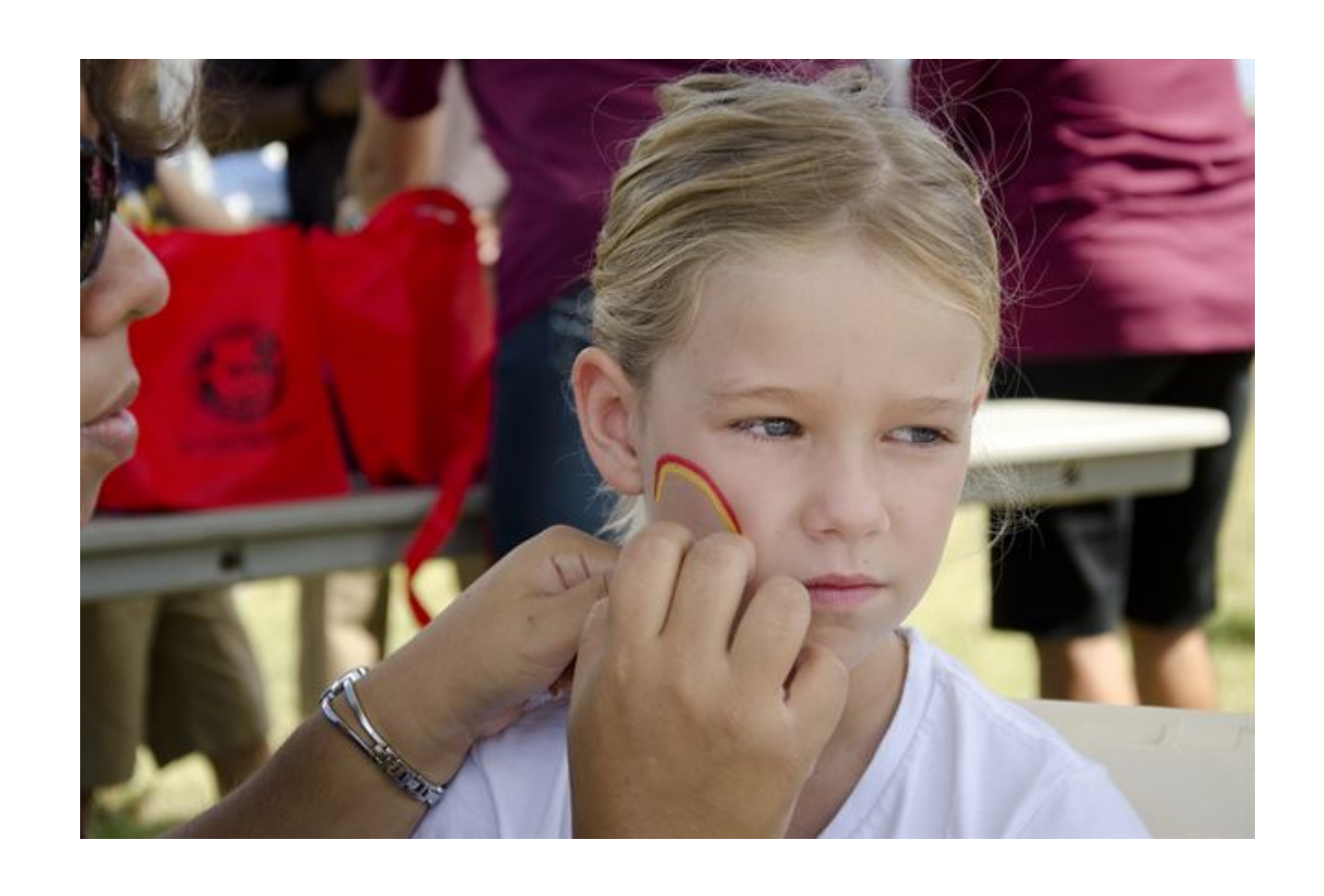
There will be face painting!